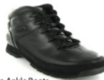
No Ankle Boots