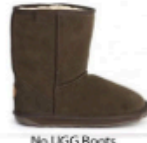
No UGG Boots

Footwear is deemed to be unacceptable if it is any colour other than plain black, overly decorative or without flat heels. Trainers, boots, pumps or canvas shoes are not permitted. Sports brands such as Vans, Converse, Nike and Adidas are not permitted.