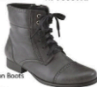
No Leather Fashion Boots