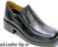
Black Leather Slip on