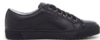
No Trainer Styles