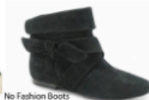
No Fashion Boots