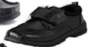
Black Leather Velcro