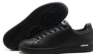
No Designer Brands