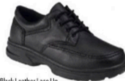
Black Leather Lace Up